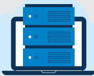
StrataConnect Server & GUI

CONNECT™ Fiber , an innovative multifunctional fiber-based network designed to enhance worker safety and increase operational and productivity efficiency.